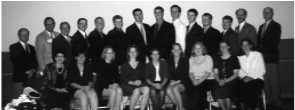
AZ members who received scholarships at the Ag Awards banquet pose with alumni who were in attendance.