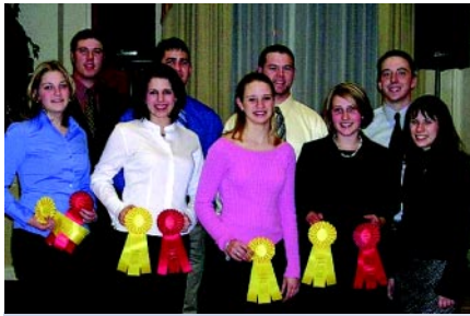
The Morrill Chapter was well represented in the NESAs competition at Rutgers University.