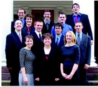
The newly initiated members of Alpha Zeta.