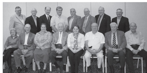
The reunion included 13 brothers and two sisters.